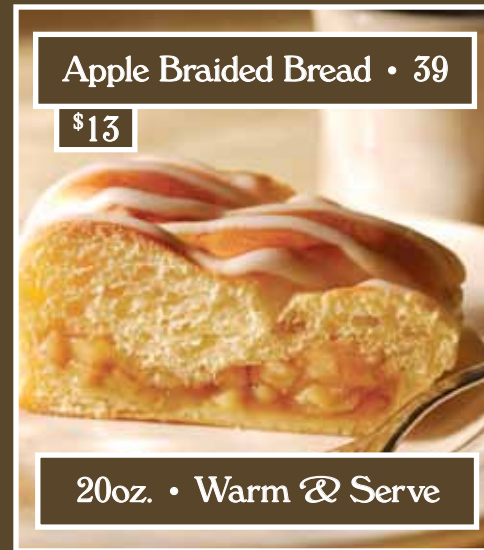
Apple Braided Bread • 39