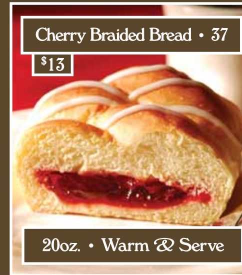
Cherry Braided Bread • 37