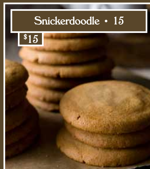
Snickerdoodle • 15