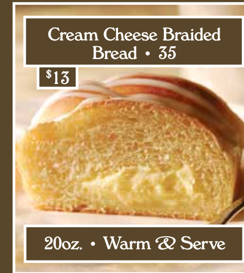
Cream Cheese Braided Bread • 35