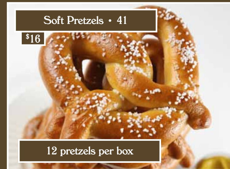
Soft Pretzels • 41

2 - (4 packs) 32 oz. total • Warm & Serve