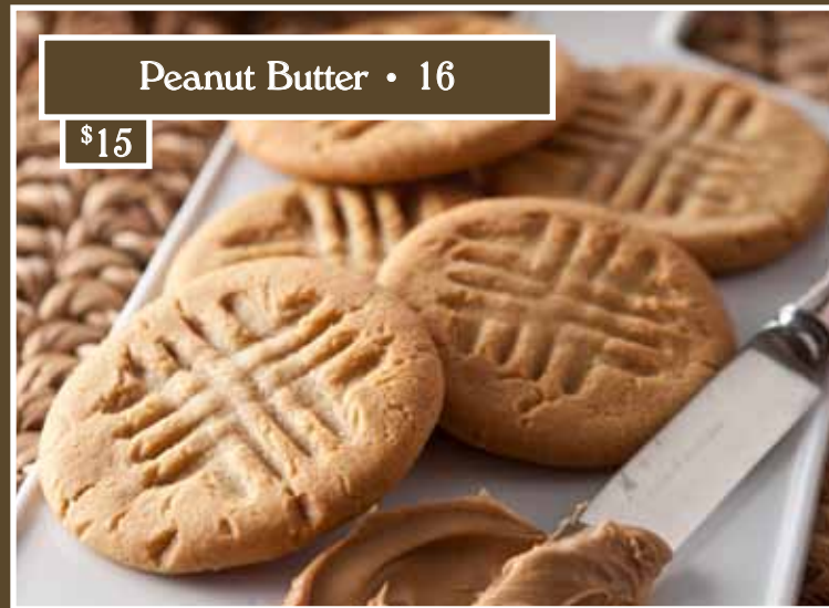
Peanut Butter • 16