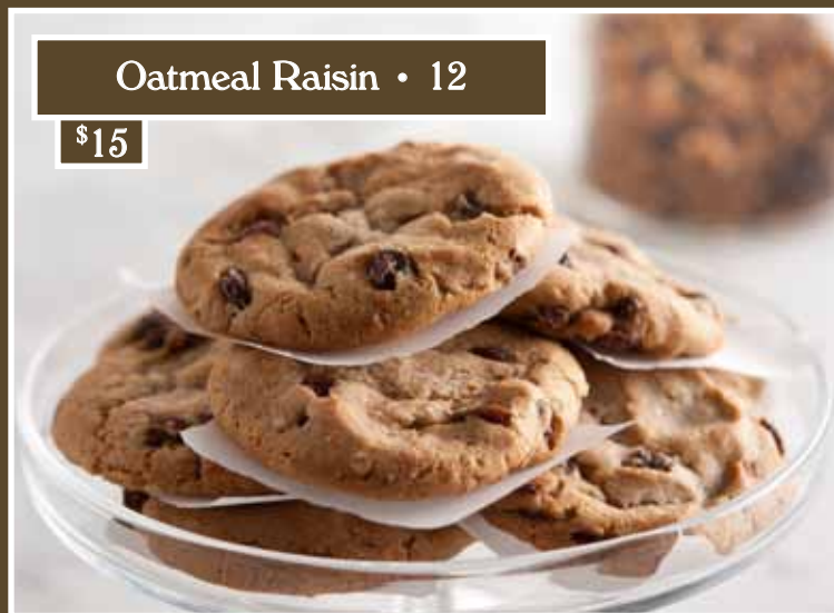
Oatmeal Raisin • 12