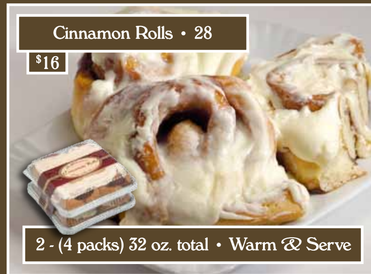
Cinnamon Rolls • 28