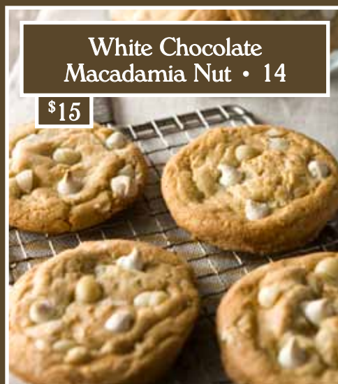
White Chocolate Macadamia Nut • 14