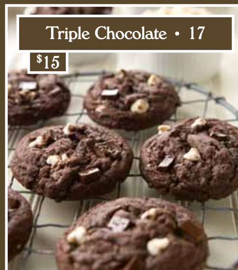
Triple Chocolate • 17