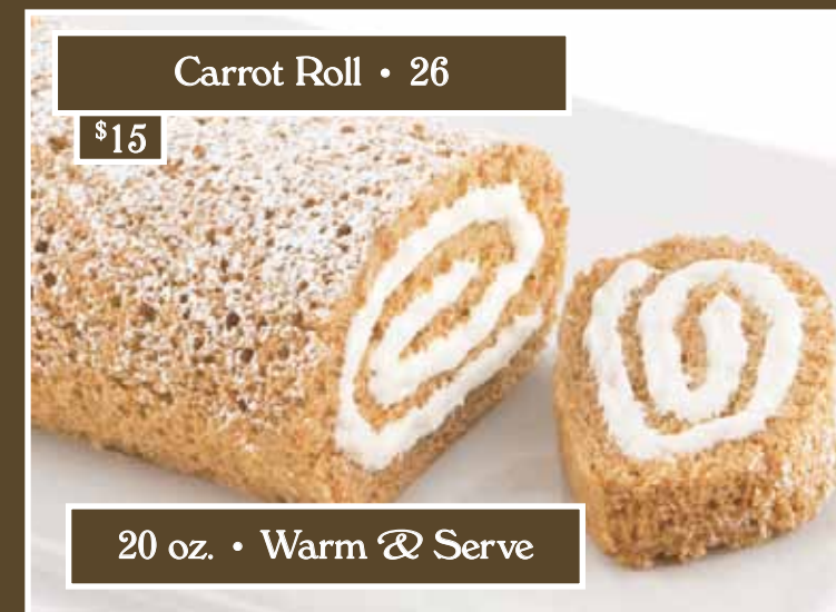
Carrot Roll • 26