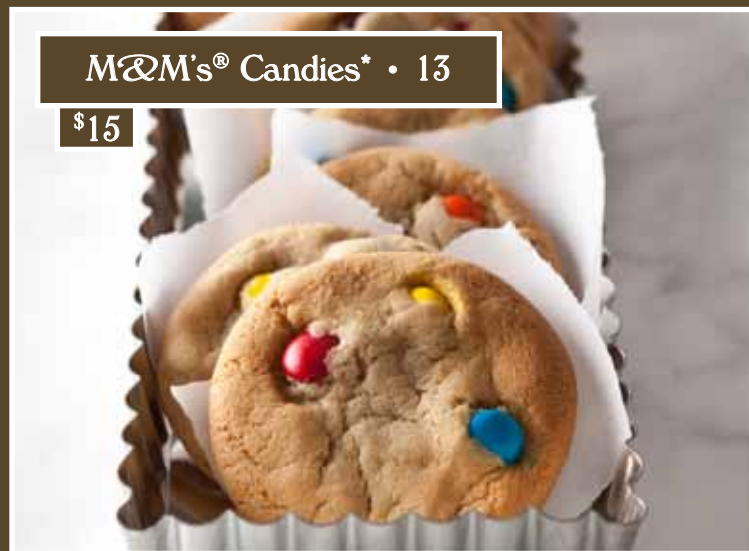
M&M's® Candies* • 13