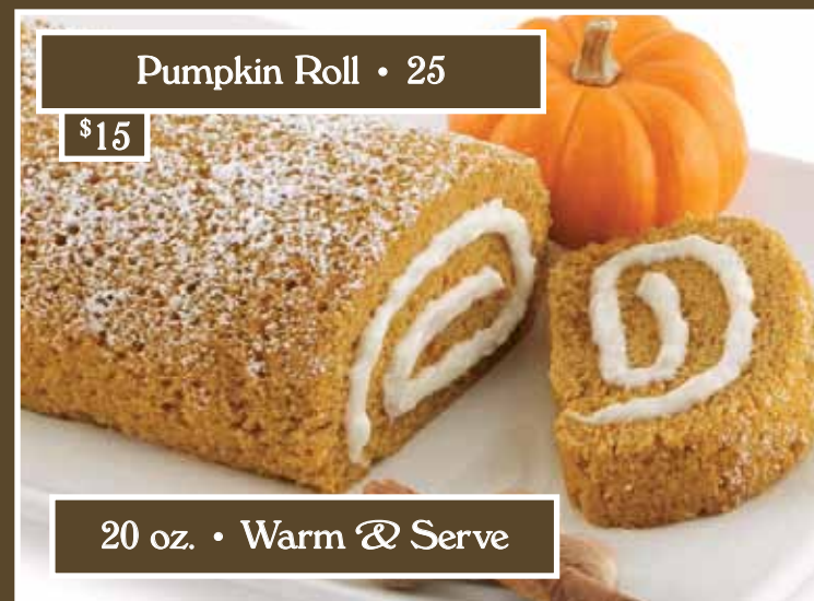
Pumpkin Roll • 25